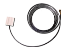
Induction pad + cable

Do not use StellaDoradus repeaters with non StellaDoradus equipment. Stelladoradus repeaters operate silently on the operators network. By using our equipment with competitors equipment you break this control system and could potentially harm the operators network. Doing so will void warranty.